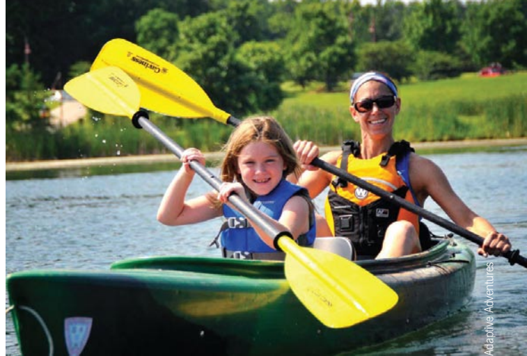
Tandem kayaking is a pleasure for those with and without physical disabilities at an Adaptive Adventures event, above, and sled hockey is available through the National Ability Center, below.