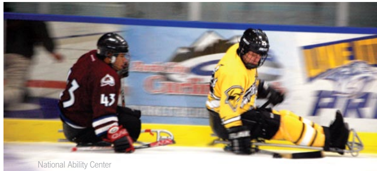
National Ability Center