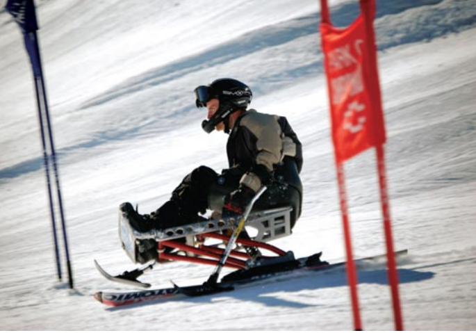
Specialized equipment allows skiers to break through boundaries at an Adaptive Adventures camp, opposite page, and at the Park City Mountain Resort, above, where the National Ability Center's ski program is based.

the creation of Adaptive Adventures, and many other businesses and organizations that support those with physical disabilities—someone cared enough to make it happen.